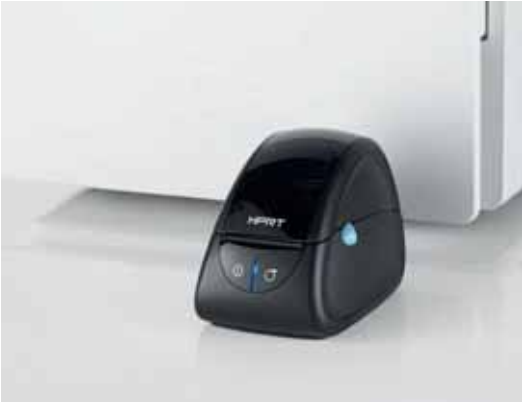
Shared printer The optional printer lets you complete the sterilisation process performed with the autoclave. To optimise management, the printer can be shared by multiple sterilisers (where enabled) and connected to the same network. One fast, reliable printing station rationalises use of space and delivers significant savings.