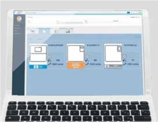
Cloud Tools Di.V.A. is an optional Cloud environment for sterilisation devices. Highly useful for saving cycle reports, monitoring the device or accessing video tutorials, manuals and usage statistics. EasyCheck, a Cloud-based remote support platform, ensures efficiency and reliability, shortening intervention times.