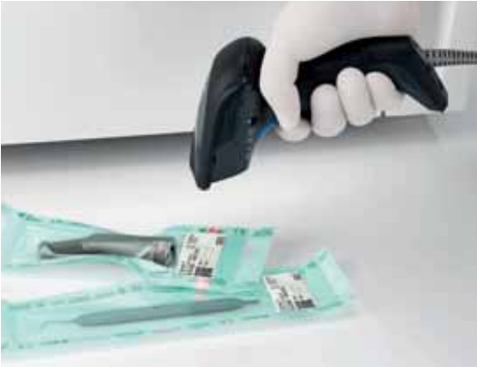
QR code labels Activating this function lets users produce adhesive QR code labels to apply on sterile packages at the end of every cycle. These contain unique information that identifies the steriliser, the cycle used, its outcome and the expiry date of the sterile package. It's also possible to print Barcode labels and cycle reports.