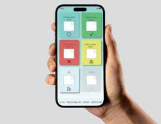
SterilConnect A highly innovative tool users will appreciate. Any network-connected mobile device can be used to interact with the autoclave, simplifying daily management of the sterilisation process. A clear yet complete graphic interface lets you monitor device status and manage various steriliser functions.

Connecting the autoclave to the network via the integrated Wi-Fi system or via the Ethernet links the steriliser to an integrated data management system, essential for advanced traceability. Users can also take advantage of other features such as automatically saved cycle reports, local or remote consultation and printer management.